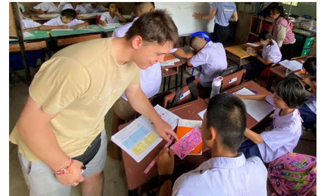
A volunteer helping students in Mae Sot