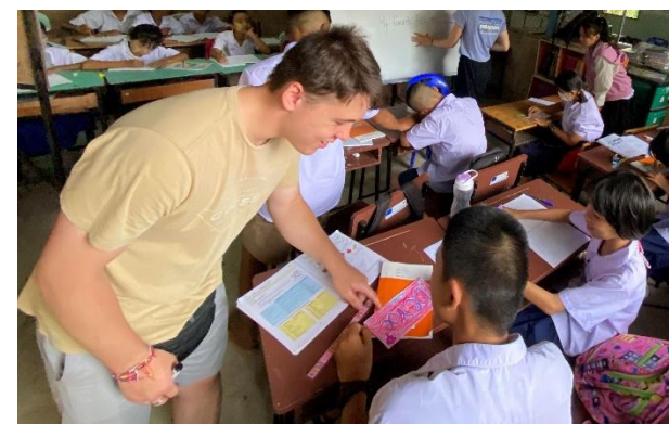
A volunteer helping students in Mae Sot