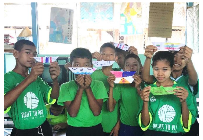
School projects and outings to the waterfall⇒