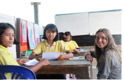
and enjoying their company