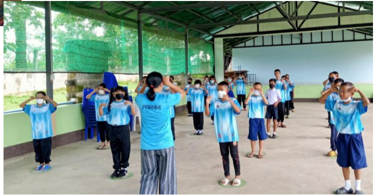
and do morning exercises.