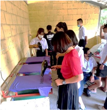
Parami Students silkscreen school T shirts...