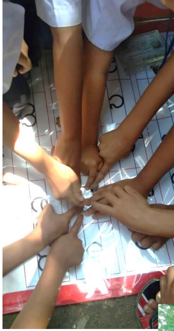
Together in person for the first time in 2 years!