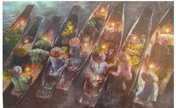
Market Day, early morning by Maung Maung Tinn, 2021

Tickets are available from Project Committee members for $65 A tax receipt for charitable donation will be given for $40.