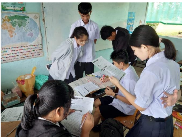
BHSOH students learn about environmental problems.