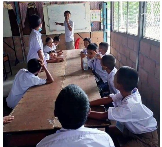
Students at Pyo Khinn enjoy their new classroom.