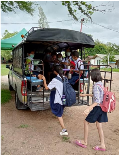
Getting ready ...