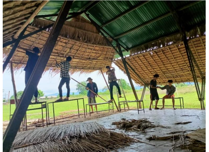
BHSOH students repair a roof.