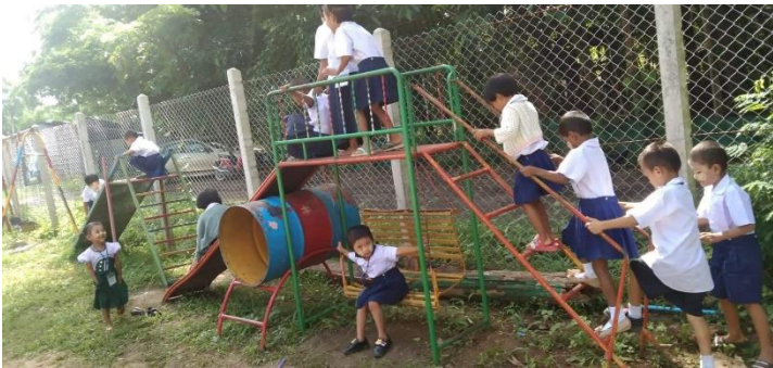
Pyo Khinn children have a new playground.