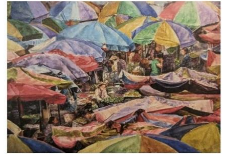
Market Day, by Maung Maung Timm 2023

As in past years, we are also running a raffle – with 40 prizes(!). Raffle tickets will be available from PC members in March and early April – and at the dinner itself where the draw will take place. See next page for the prize list.