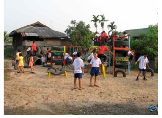
The new playground at Hsa Mu Htaw School

surrounding She sought school out an NGO in Mae Sot that constructs playgrounds, but it was too busy to help. So she used a guide developed by this organization to design and provide materials a playground for which she paid for herself. Parents and teachers provided the